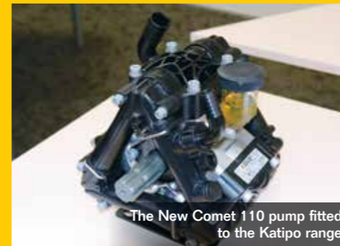
The New Comet 110 pump fitted to the Katipo range