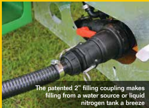
The patented 2" filling coupling makes filling from a water source or liquid nitrogen tank a breeze

The position of the pump is offset slightly, mainly for agitation purposes but also so there is a high volume sump for high application rates. This offset doesn't impact on the longevity of the driveshaft as it is still well under the 30-degree threshold and sits comfortably behind the tractor with even weight distribution.