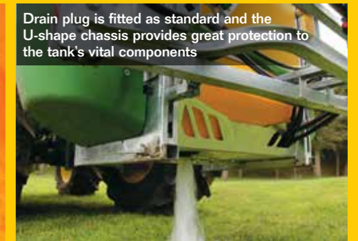
Drain plug is fitted as standard and the U-shape chassis provides great protection to the tank's vital components

The large lid at the top is the obvious place to fill if you are not set up with a two-inch hose, although this is the only downside of the machine for me. A large sieve here would be ideal. If your high pressure hose water isn't sparking, something needs to stop the bigger particles making their way into the tank so you don't have to clean the main filter as often. This also stops your tips regularly blocking up. The team at Hustler tells me the large sieve actually comes standard on all models but the test machine wasn't using one on test day.