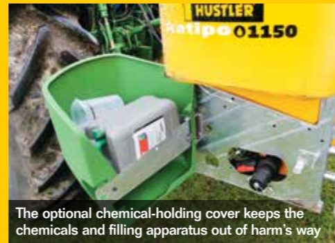
The optional chemical-holding cover keeps the chemicals and filling apparatus out of harm's way