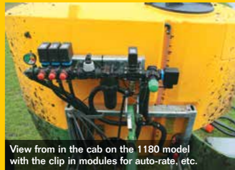
View from in the cab on the 1180 model with the clip in modules for auto-rate, etc.