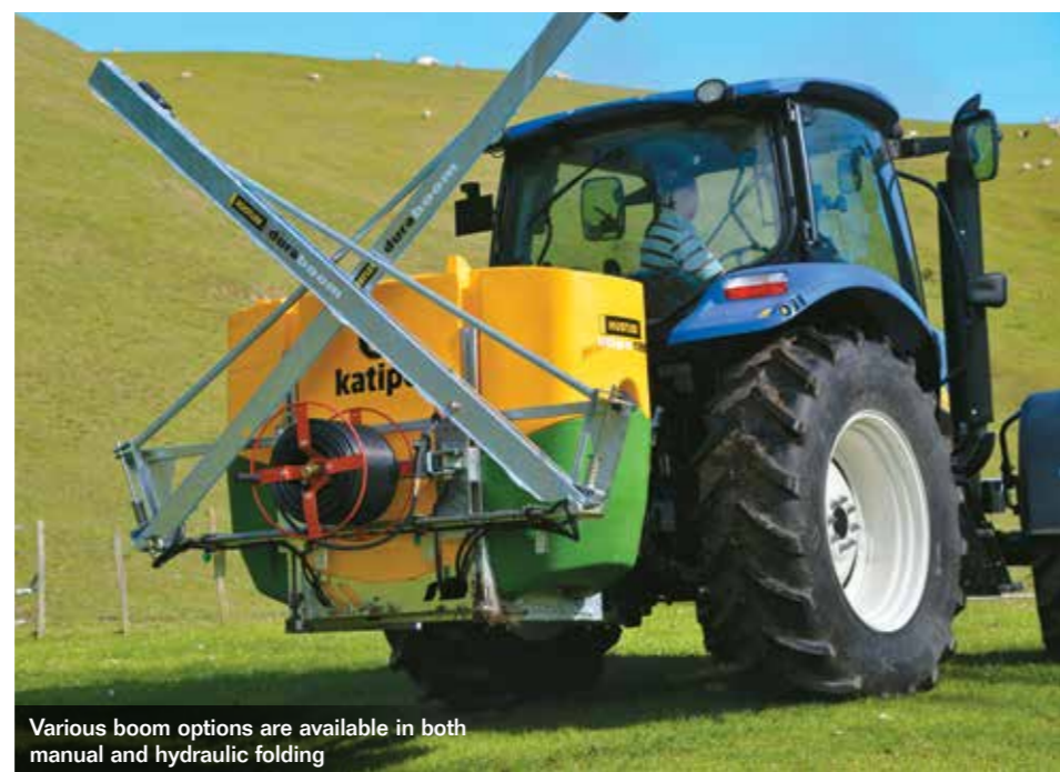
Various boom options are available in both manual and hydraulic folding

In terms of chemicals and mixing, the agitation aggression can be adjusted for chemicals, such as roundup, where they foam up easily. The settings range from barely moving right up to a washing-machine-like setting. The tank has been cleverly designed without flat areas and therefore no settlement of chemicals, particularly when using powders. This also helps agitation, as there are no eddies of calm water and so a vigorous and constant agitation is maintained throughout the tank.